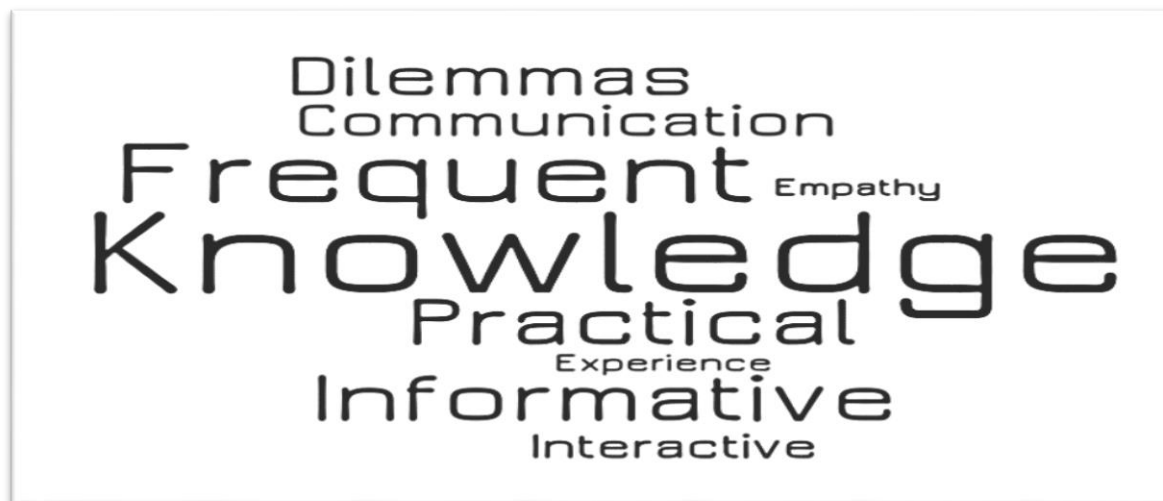
Figure 2: Words used to describe the workshops

The participants specifically commented on the teaching methodologies used in these workshops. A remark on simulated patients and case discussions said: “it was really beneficial for future interaction with patients” . Another participant wrote: “Practice session with simulated patient was helpful... as real life situation”